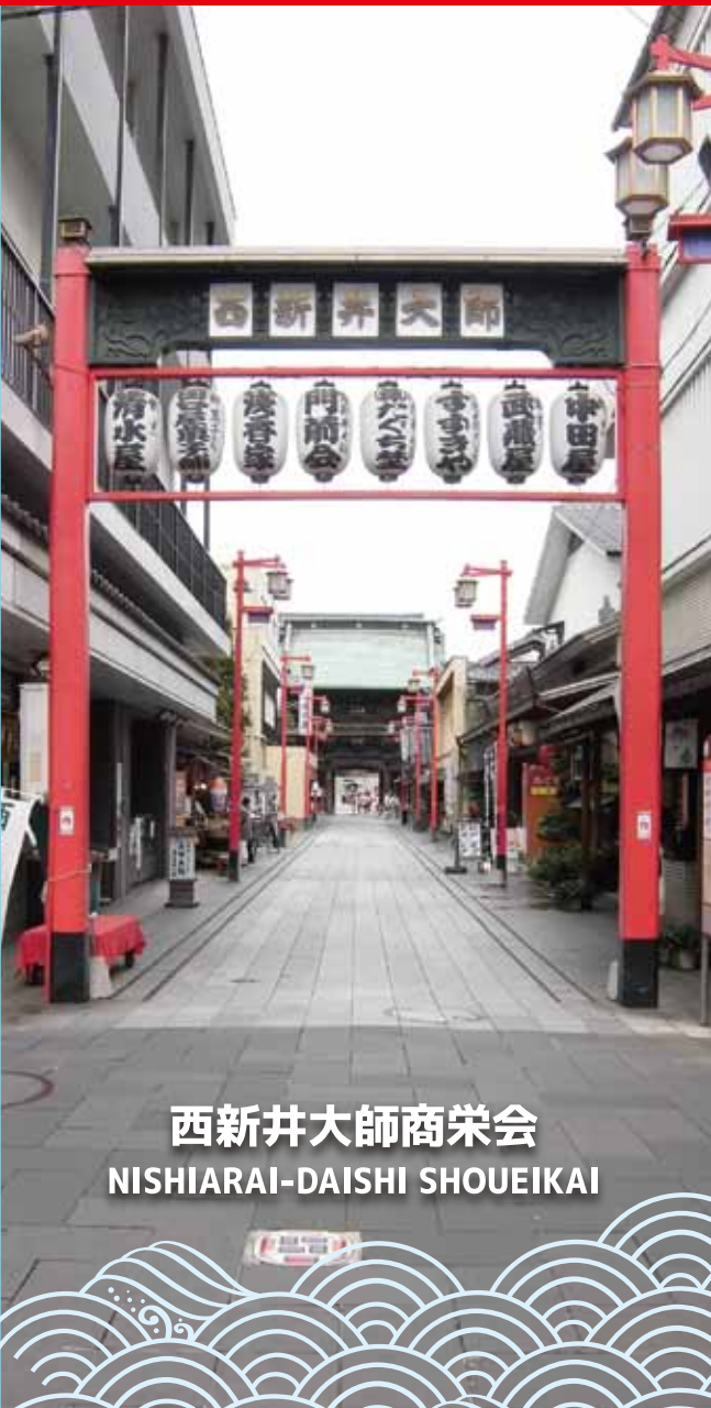
西新井大師商栄会 NISHIARAI-DAISHI SHOUEIKAI