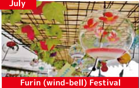
Furin (wind-bell) Festival