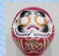
だるま Daruma (tumbler doll)

"Anko" is made from well-boiled red bean called Azuki. First, boil red beans with plenty of water until they get tender. Then add the same amount of sugar and simmer until water evaporates. Finally add little bit salt to bring out sweet taste more. "Anko" is like whip cream and custard cream for cakes, which means it is essential to Japanese sweets.