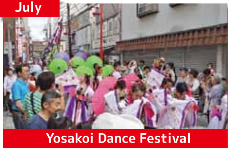
Yosakoi Dance Festival